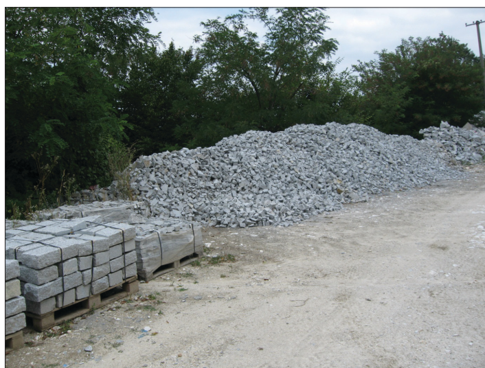
Figure 5 - Granite cubes and curbs „Ploča“