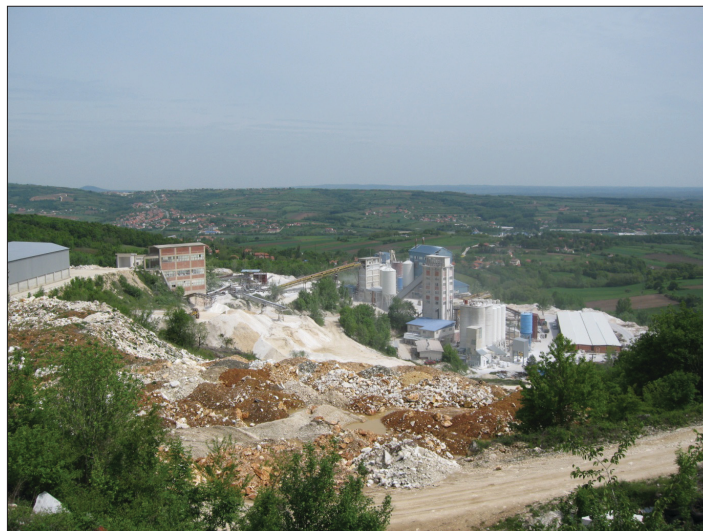
Figure 3 - The marble grinding mill ( Omya Venčac )

Significant quarries in which marbles are exploited are the Vrbica Cop, Venčac, Brezovica and Krečana. Apart from marble from Krečana (due to the cracking mass, it is not possible to get blocks from which architectural stone could be obtained), all others satisfy the conditions to be used as architectural stone, in the industry, for the production of aggregates and the production of mechanically or chemically stabilized lower and upper carrier layers of pavement structures (buffer, cement and bitumen stabilization) and cement concrete. As broken, the stone can be used for making stone embankments, dikes, fillings, etc. As broken or processed, it can be used for all masonry and coatings (civil engineering, hydraulic engineering) (Jovanović, Carević 2017). The exploitation of marble on Venčac is especially developed. The leading company “Omya Venčac” is engaged in the production of, in particular, ground stone material, for which there is a great demand in the market, as well as technical stone and blocks that distributes to other processors. Due to poor competitiveness (or under-profit), the processing of cutting and polishing has stopped, as well as the production of decorative items.