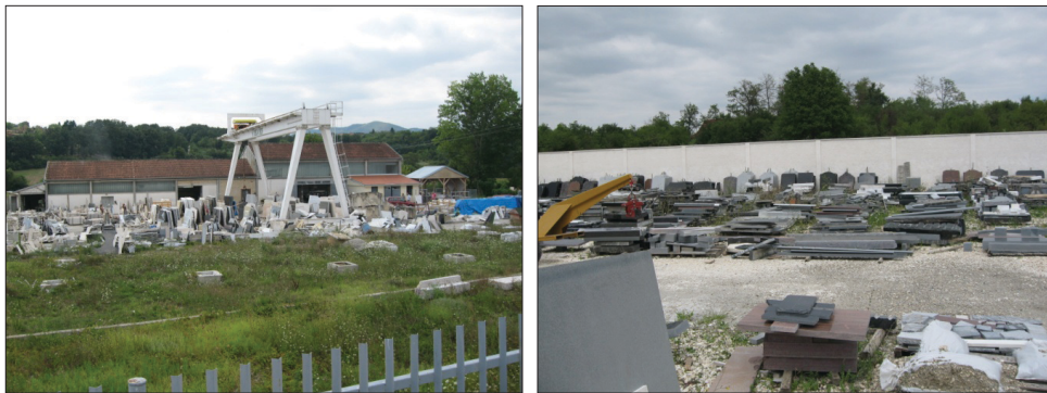
Figure 6 - Some of the major stone processing facilities

Concerning granite, there are several active quarries on Bukulja and Šutica. According to its significance, the quarry "Ploča" ("Babica Cape"), which previously belonged to the company Venčac, is distinguished, and is now successfully privatised. After the privatisation, production has intensified and adjusted to market demand. Good blocks are made here, mainly by cutting, and less with the use of weak (deflagrant) explosives. At the very quarry "road haberdashery" is produced by carving. Quality cubes and curbs, due to the quality and durability of this stone, are increasingly demanded on the market. A part of the material is cut down on the quarry, and the rest in the processing facilities or is being distributed to other processors. Other granite quarries are much smaller and exploitation is done by smaller entrepreneurs for the needs of their processing facilities.