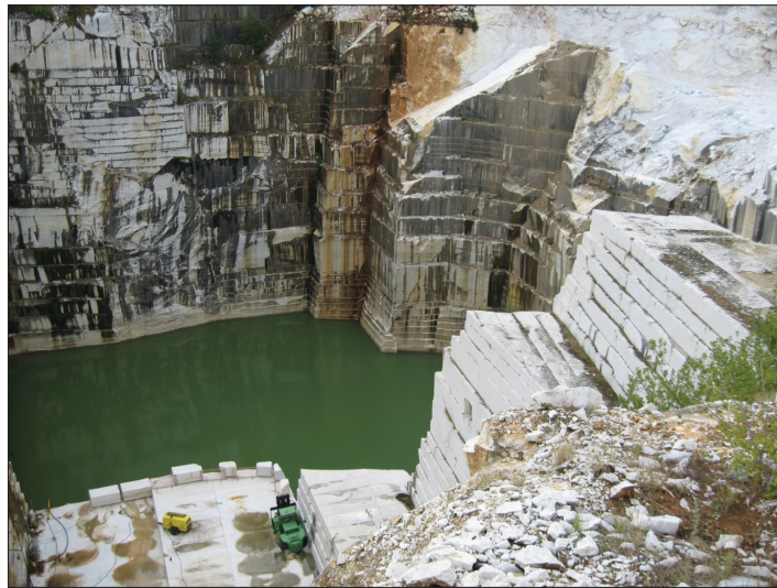
Figure 2 - Marble quarry on Venčac (Omya Venčac)

Of the major exploitation fields there are the granite quarry Stan, Glišića Majdan, Mala Orlovica and Ploča (Babića rt). Granites from all these deposits, based on the performed laboratory analyzes, can be used for the production of aggregates and the construction of layers of road pavement structures (depending on the traffic load); for making cubes, slabs, curbs and other stone haberdashery; for all masonry and coatings in civil engineering and hydraulic engineering (Jovanović, Carević 2017). Where appropriate exploitation can be obtained, blocks of satisfactory quality can be used as architectural stone, and also for coating, paving and making tombstones.