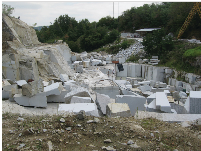
Figure 4 - Granite Quarry „Ploča“ in Bukovik