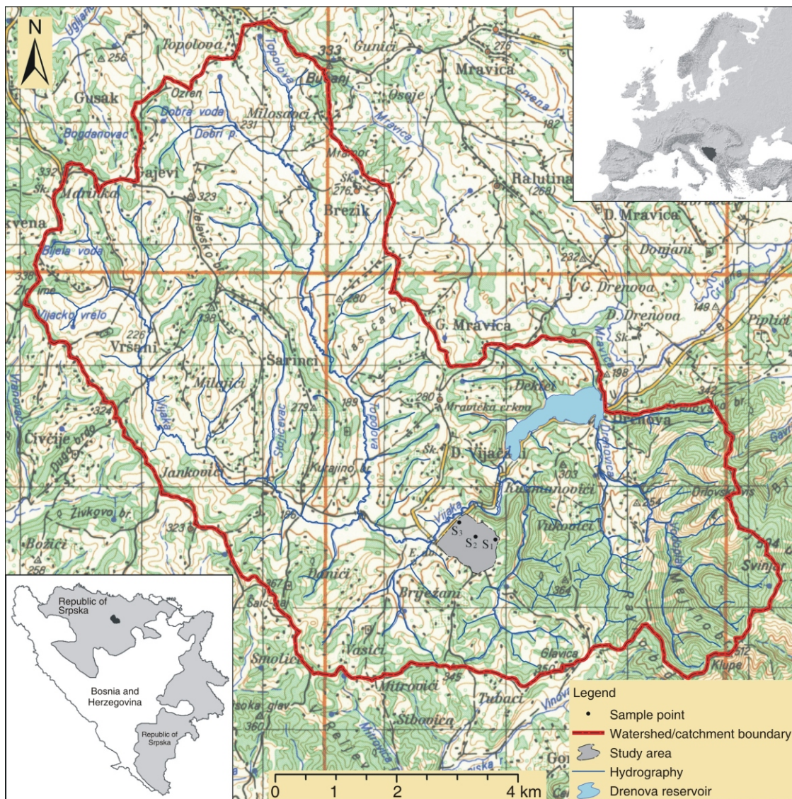
Figure 1. Location of study area