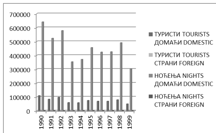
Chart 1. Overview of the number of tourists and overnight stays

In the early 1990s, or in the late 1980s, the country was facing an economic crisis affecting a large number of countries in the region. The war in these areas, which began in 1992, leads to a difficult situation in the country, which is reflected in the entire society, economy and even tourism. The data in the Table 1 clearly shows a drastic decline in both the number of domestic and foreign tourists until 1998, even though the war ended in 1995. It is evident that after the war, general conditions were not favorable to tourism. The data in tables then shows a slight increase in the number of domestic tourists in 1998, but also a drastic decline during the 1999 bombing. The number of foreign tourists is still negligible compared to the number of domestic tourists.